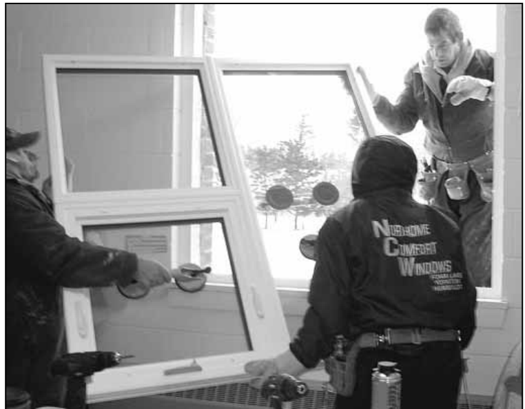
A crew of workers installs a double window in the abbey residence.