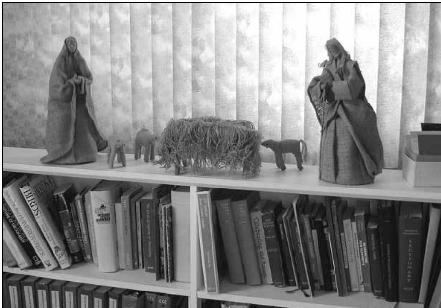
Nativity scene in the abbey recreation room.

Colony. The following account of Christmas in St. Peter's monastic church and various parishes in St. Peter's Colony in 1905 are found in the Bote for Dec. 28.*