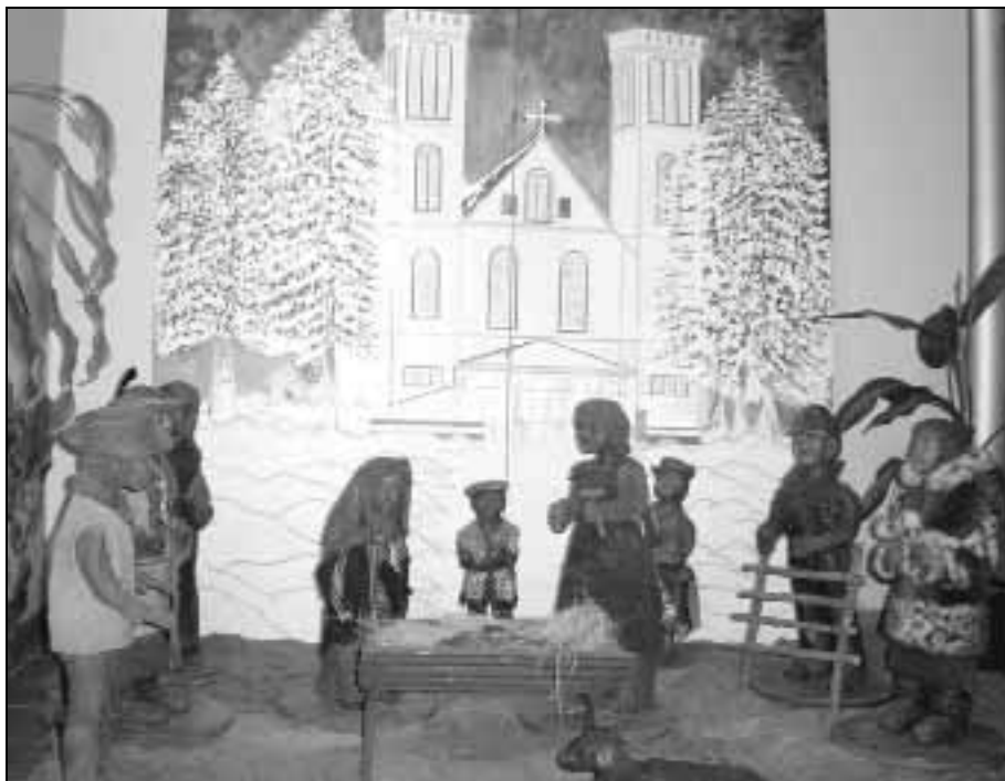
This nativity scene was indoors and near the entrance of Sts. Peter and Paul Abbey Church. The attempt is made to represent many different nations, cultures and ways of life. It shows that Jesus Christ was born for everyone and everyone has his/her place in the Bethlehem stable. The sketch in back is of St. Peter's Cathedral at Muenster.

The tradition of having Christmas mass at midnight came to the former St. Peter's Colony, later St. Peter's Abbacy, from Germany and the United States. As you will see in account of masses 100 years ago, not every place had their first mass at midnight. We must remember that the settlers only began to arrive in 1903. Until then it was all virgin land. However, the early settlers along with their families, flocked to the Christmas masses. Their means of conveyance were sleds drawn by horses or oxen. At first there were no roads, but that quickly changed. Roads were a priority.