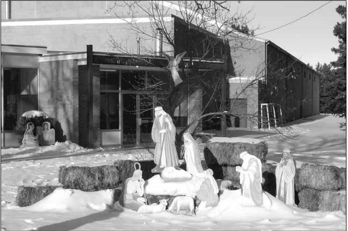
Outdoor nativity scene near the entrance to the college gym.