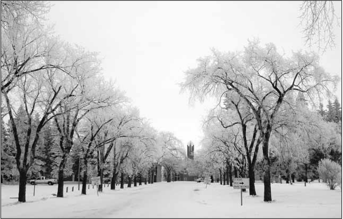
Mother nature did its own decorating of trees. View from the road leading to the gym, guest wing and Michael Hall. There was an abundance of hoar frost.