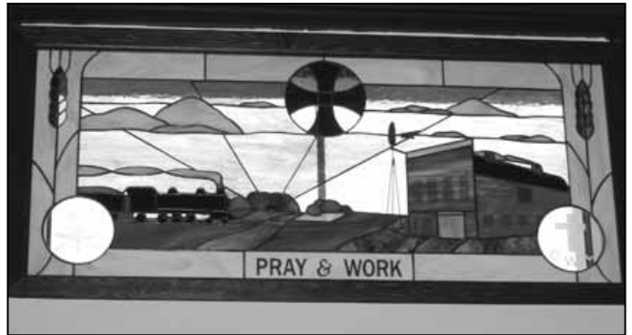
The Weber family is honored in this stained glass window in Room 101 at St. Peter's College.