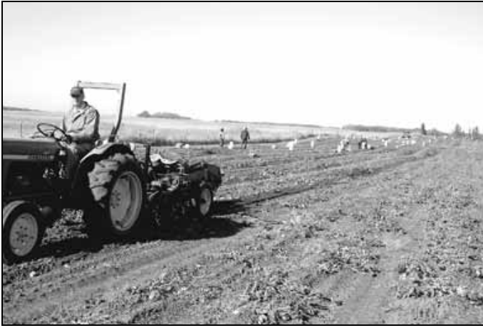
Labour Day weekend is the annual time for picking potatoes.