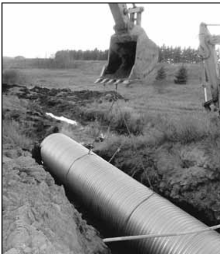
A culvert was installed on the road leading to the abbey.